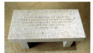
Jenny Holzer , Selection from 'The Living Series' , 1989. Bethel white granite, 36 x 18 inches.