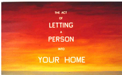
Edward Ruscha , The Act of Letting a Person into Your Home , 1983. Oil on canvas, 84 x 137 3/4 inches.