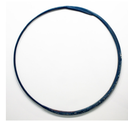
Martin Puryear , Ardea , 1981. Alaskan cedar & Ponderosa pine, 66 x 66 inches.