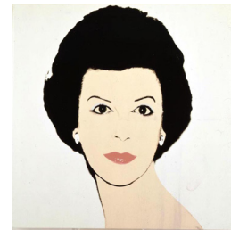
Andy Warhol , Emily Fisher Landau , 1982. Synthetic polymer paint, silkscreen ink on canvas, 40 x 40 inches.