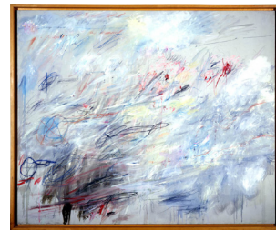
Cy Twombly , Untitled , 1964+84. Oil, graphite and crayon on canvas, 80 3/8 x 98 1/4 inches.