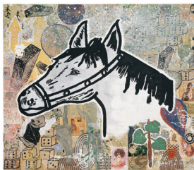
Donald Baechler , AUTONOMY OR ANARCHY #2 , 2003. Acrylic, paper, and fabric collage on paper, 99 x 114 inches.