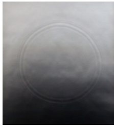
Adam Fuss , Ark , 1990. Unique gelatin silver print photogram, 57 3/4 x 55 inches.