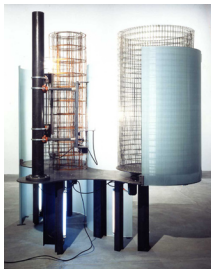
Jon Kessler , City , 1989. Glass, steel, aluminum, steel mesh, motor, 92 x 94 x 70 inches.